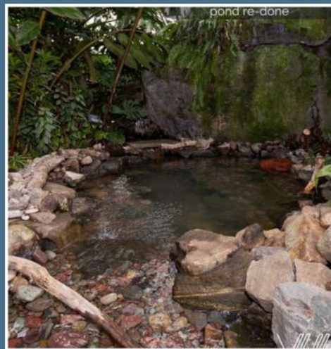
Pond / After