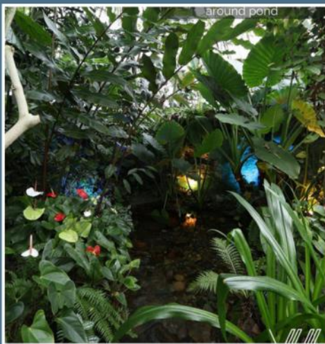
Pond / Before

Today, as visitors meander through the pyramid, they can again enjoy the sights and sounds of a beautiful water oasis surrounded by a lush, tropical environment.